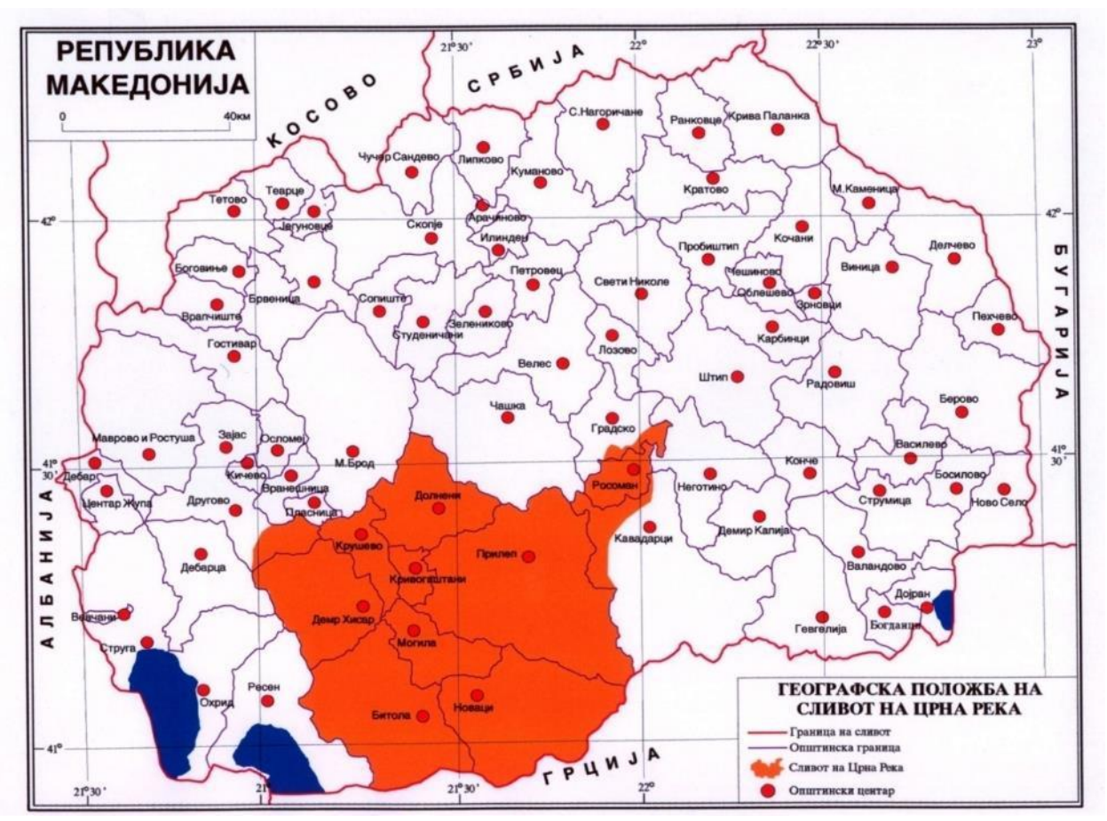
Map 1. Geographical position of the Black River Basin in the Republic of Northern Macedonia